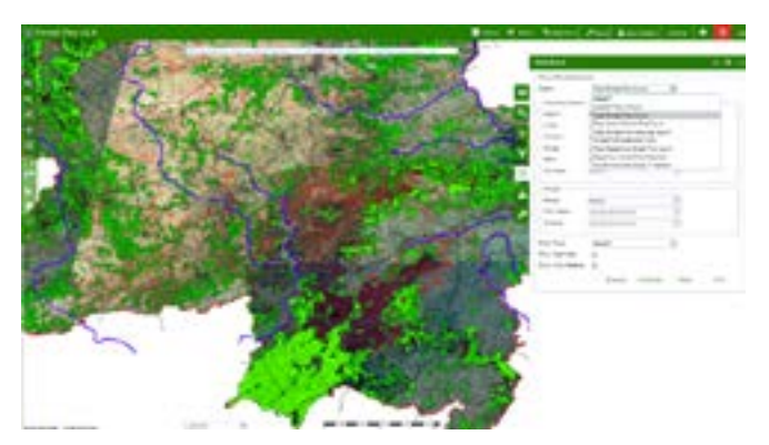
Total forest fire count in a southern district of Jharkhand

These forests represent a significant resource for the state, with both forestry (primarily teak) and non-timber forest products such as medicinal herb collection contributing to the welfare of the citizens.