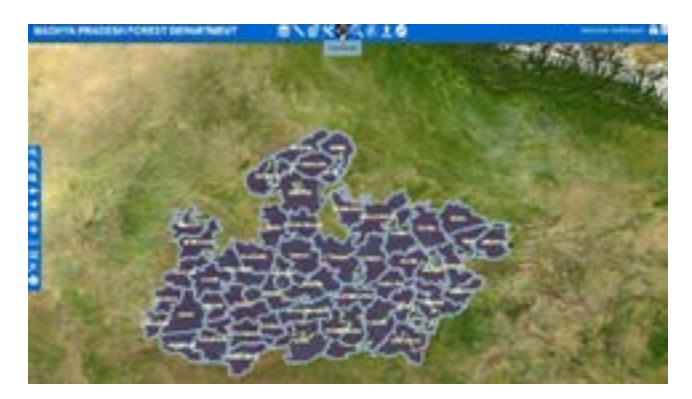
Madhya Pradesh Forest Department portal provides maps to the public. Registered and domain users have access to advanced processing and GIS functionality.

Madhya Pradesh Forestry Department has formed 15,228 Joint Forest Management Committees that protect and manage about 70% of the state's forest areas.