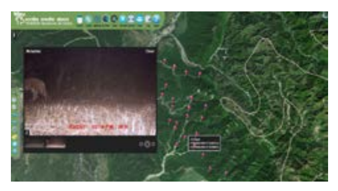
Video feed of wildlife sightings inset on a map of marked sightings, provided in Wildlife Institute of India portal.

Based in Dehradun, Uttarakhand, India, situated near the Himalayan foothills, Wildlife Institute of India trains biologists, wildlife ecologists, socio-economists, and managers to build up scientific knowledge, carry out research, and provide information on conservation and