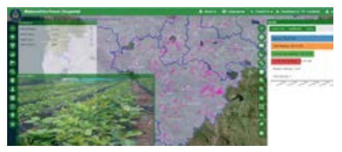
Plantation seedling statistics, maps, and images in Maharashtra Forest Geoportal

Maharashtra Forest Department, custodian of Maharashtra state's rich bio-diversity, aims to augment green cover on non-forest areas to achieve national targets of 33% of land area to be under green cover.